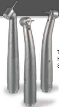
TwinPower Turbine® High Speed Handpieces Standard, Mini & New 45°

TwinPower Connection Options: TwinPower Morita, KaVo® MULTiflex® LUX*, SIRONA® R/F*, W&H® Roto Quick*, and NSK® Mach/Phatelus®/ FlexiQuick Coupling**