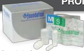
Foundation® Bone Augmentation Material

Purchase 2 boxes of Foundation Bone Augmentation Material (any size), receive 3 boxes (9 x 50 ml cartridges) of PerfectIM, Blue Velvet Bite Registration FREE.