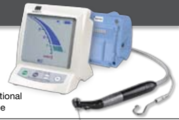
Root ZX® II Apex Locator with optional Low Speed Handpiece