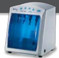
Lubrina™ Handpiece Maintenance System

* KaVo MULTiflex LUX is a registered trademark of Kaltenbach & Voigt GmbH. Sirona is a registered trademark of Sirona Dental Systems GmbH. W&H and Roto Quick are registered trademarks of W&H Dental Bürmoos GmbH. ** NSK and Phatelus are registered trademarks of NAKANISHI INC. Name of coupling varies by country.