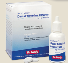
TEAM VISTA DENTAL WATERLINE CLEANER

Buy 3 Enzymax Earth™ Products, receive 1 FREE (equal or lesser value)