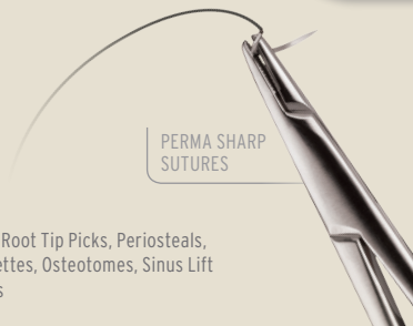
PERMA SHARP SUTURES

Mix and Match any 5 surgical hand instruments, receive 1 FREE*