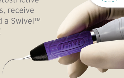
SWIVEL XT INSERT

Buy any 4 Piezo Ultrasonic Tips, receive 2 FREE