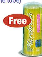
Microbrush ® Tube Series