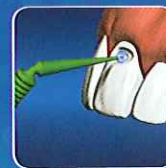
Regular (2.0 mm)