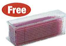
Microbrush ® Plus Dispenser Series

Get your choice of 100 FREE micro-applicators any size (one cartridge or one tube)