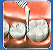
Superfine (1.0 mm)